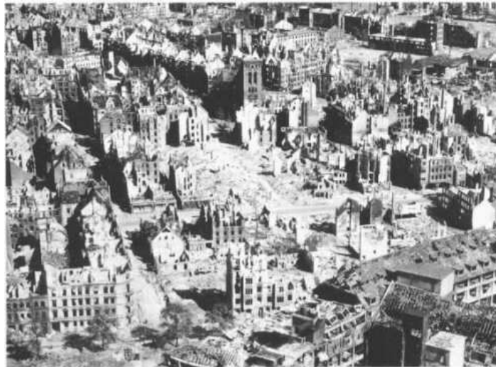
TOTAL RUIN - Hanover, Germany lay in utter ruin at the end of World War II. West Germany, member of the European Economic Community, has been completely rebuilt, and now has one of the strongest economies in the world.

Far-sighted Winston Churchill saw the need for reconciliation among nations - particularly of France and Germany. And noting the menace posed by the Soviet Union to world peace, on September 19, 1946 he proclaimed in Zurich, Switzerland: "We must build a kind of United States of Europe." He foresaw the potential good that could arise from a wisely led, politically sound, militarily secure United States of Europe.