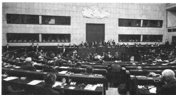
European Community Photo EEC PARLIAMENT - The European Economic Community Parliament is shown in session in Strasbourg, France.

4. Whom will God use as His instrument to fight against modern Babylon? Isa. 13:17; 21:2, 9; Jer. 51:11.