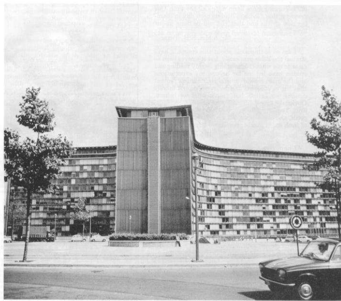
Common Market Headquarters

An International Course of Biblical Understanding