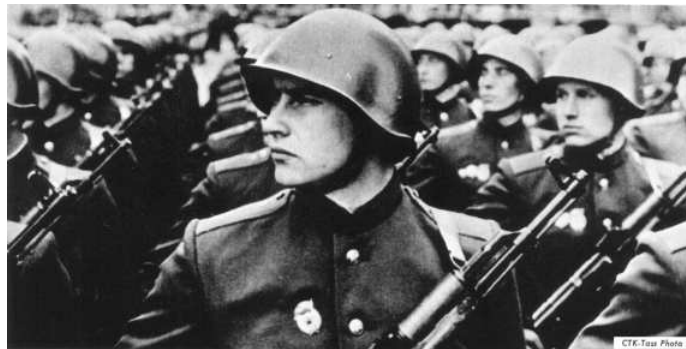
Vast armies will converge on Jerusalem to fight the returning Jesus Christ!

3. Are these demons responsible for gathering the armies of all nations together? Rev. 16:16.