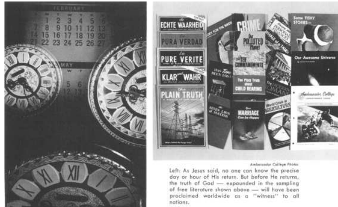
Left: As Jesus said, no one can know the precise day or hour of His return. But before He returns, the truth of God — expounded in the sampling of free literature shown above — will have been proclaimed worldwide as a "witness" to all nations.

5. Since we cannot know the day and hour, can we nevertheless know very near the actual time of His return? Matt. 24:32-33.