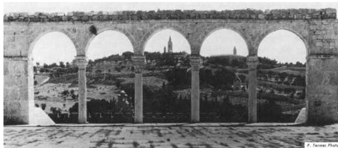
MOUNT OF OLIVES - Ancient arch of the temple platform in Jerusalem frames the Mount of Olives, site of Christ's prophesied return.

To the average person, the idea of Jesus Christ returning to earth is a fantastic fable that has no bearing whatsoever on the realities of life. Yet millions of professing Christians still expect the second coming of Christ - though widely divided among themselves as to why , how He will appear.