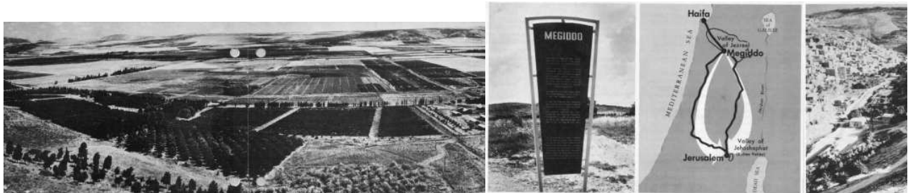
"ARMAGGEDON" - VALLEY OF JEZREEL BORDERING MEGIDDO - Bible prophecy reveals that just before God establishes His rule on earth, armies will gather in the Valley of Jezreel adjoining Megiddo. They will then converge on Jerusalem to fight Jesus Christ who is coming to enforce peace on a rebellious world. Below Right - KIDRON VALLEY - Here Christ will vanquish the rebellious armies attempting to destroy Him after He has returned to earth.

2. And yet is Christ also pictured as coming as a "thief"? Rev. 16:15. Does this mean He will return secretly - invisibly - in a clandestine manner?